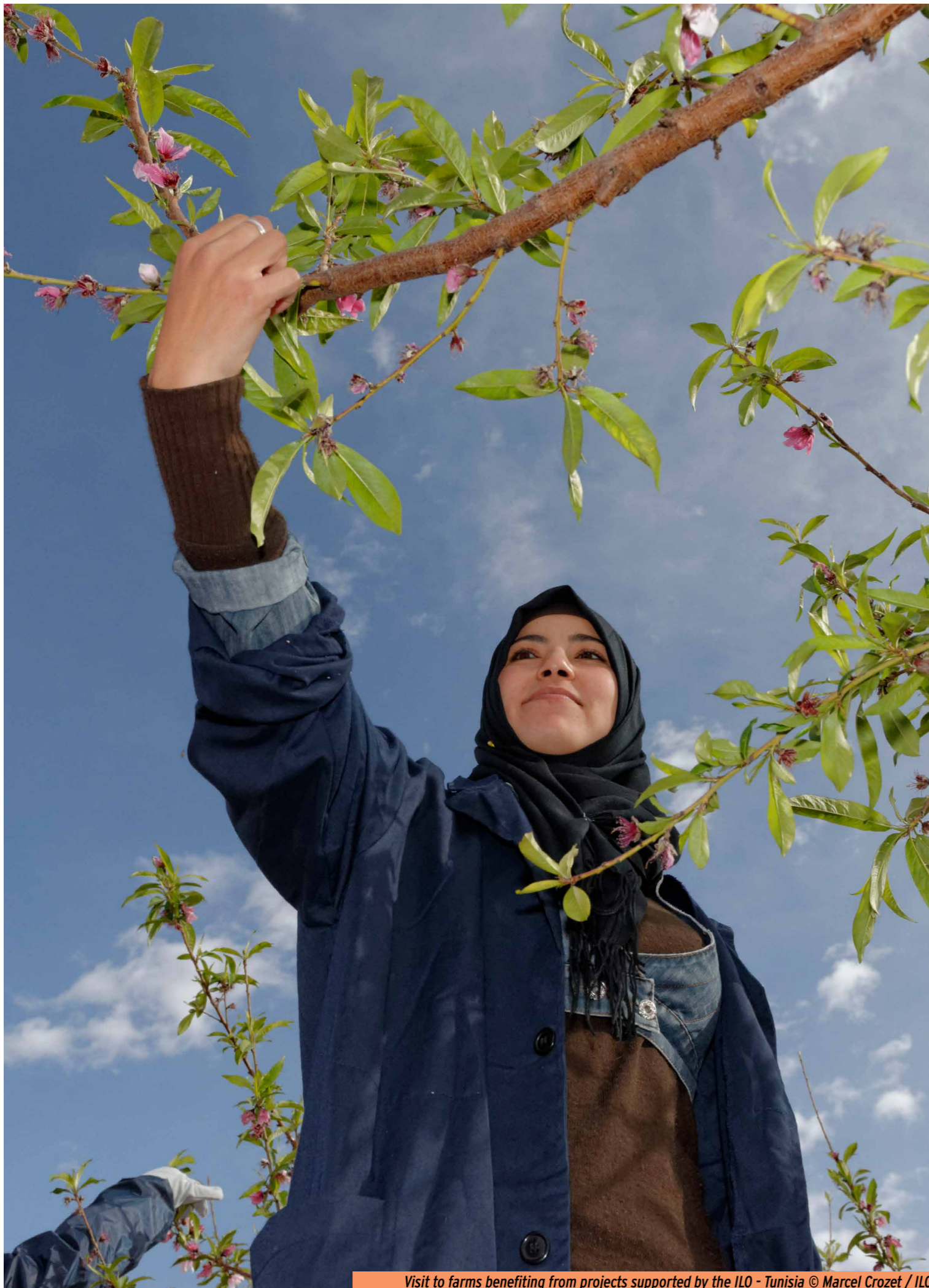
Visit to farms benefiting from projects supported by the ILO - Tunisia