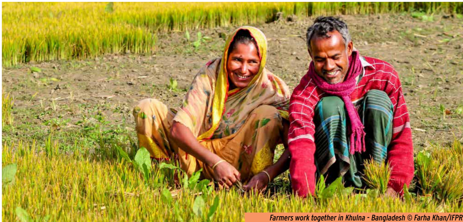
Farmers work together in Khulna - Bangladesh