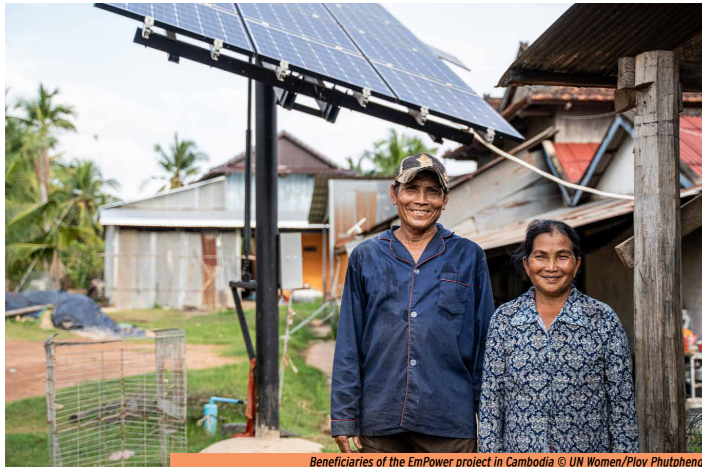
Beneficiaries of the EmPower project in Cambodia

Water security is defined as sustainable and reliable access to adequate quantities of safe and acceptable quality water to meet all needs [68]. Water security comprises issues that relate to water availability (drought, flooding), accessibility (reliability, distance), affordability (cost), and quality and safety (e.g., presence of chemicals and pathogens). These issues can impact both agri-food systems, including aquatic and animal source foods, and human health. A commonly used tool to measure individual and household water insecurity is the Water Insecurity Experiences Scale [7,69]. Water and sanitation access and quality are also frequently assessed via self-reported questionnaires in population-level surveys.