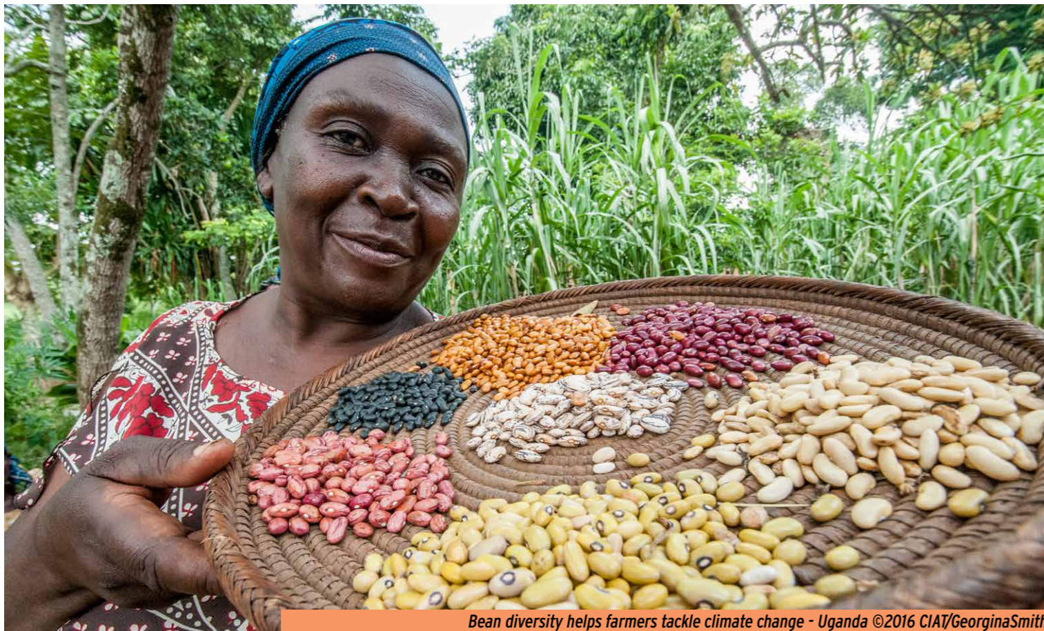
Bean diversity helps farmers tackle climate change - Uganda