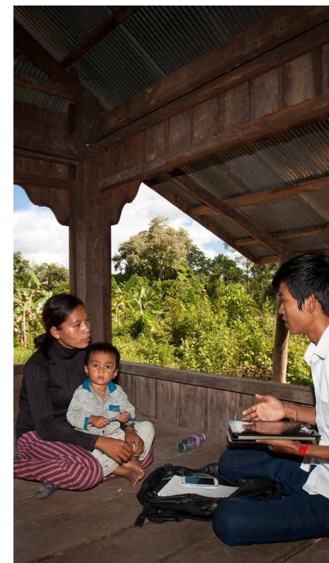
Interview with a woman farmer outside of Siem Reap - Cambodia

The Multifunctional Landscapes Science Program supports diverse diets while empowering women farmers. Policy Innovations are essential for developing frameworks that promote food sovereignty, sustainability, and equitable access to nutritious foods, ensuring that socially excluded groups have a voice in framing policies and supporting their implementation. Establishing a strong evidence base is further enhanced by the Digital and Data Accelerator, which leverages innovative technologies to improve data accessibility and inform decision-making, empowering households and communities to make healthier dietary choices. The Capacity Sharing Accelerator aims to build skills and knowledge among stakeholders, promoting the exchange of best practices to enhance local capacities. These programs and accelerators contribute to a comprehensive strategy that fosters robust food environments and systems, improving nutrition, diet, and health outcomes for the most socially excluded populations.