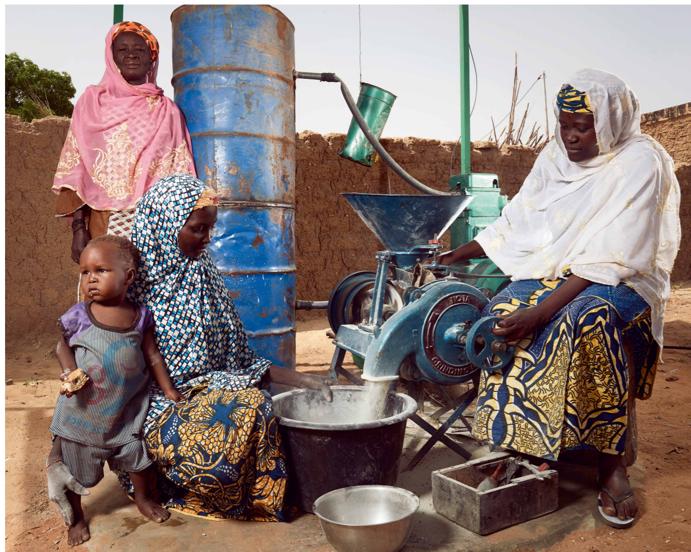
Products based on local grains are prepared with devices such as this processing unit