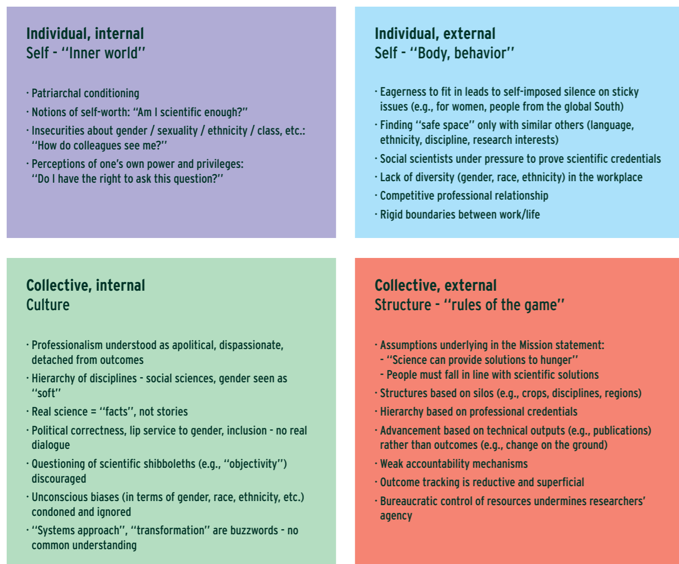
Figure 3: Biases and assumptions that can underlie GESI research culture within the CGIAR

Applying the same framework, Menon Sen and colleagues (2021) map some of the reasons why, despite robust research and evidence, gender transformative research has not permeated across centers, programs and initiatives within the CGIAR (Figure 3).