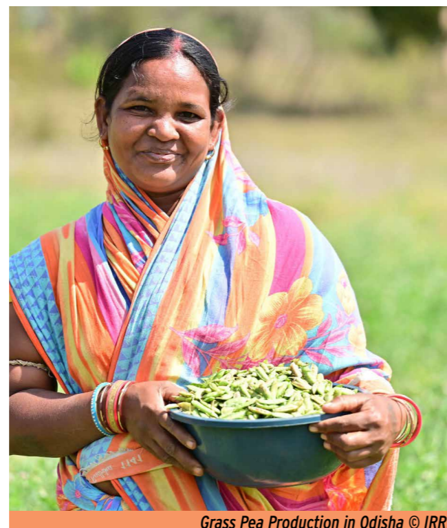
Grass Pea Production in Odisha

SRA also highlights the importance of clarity of intention in development policy. In the context of FLW policy, this means recognizing that productivism is the intention - or the spirit - behind the vast majority of agrifood systems policy and institutional spaces. Transforming this root spirit is paramount to inclusive and sustainable FLW transformation. “Production-first” priorities impact ecological resilience (Steffen et al. 2015) and disallow focusing on GESI. Food systems innovations across value chains, as well as climate-mitigating interventions are shaped by an overt economic focus for increasing productivity, which disallows tackling poverty and social inequalities (Coles and Mitchell 2011; Njuki et al. 2011; Barrientos 2014; Allaire and Daviron, 2018; Larson 2016). Policies that enable inclusive and sustainable food systems will need to have a core focus on socio-ecological resilience (Löv 2020).