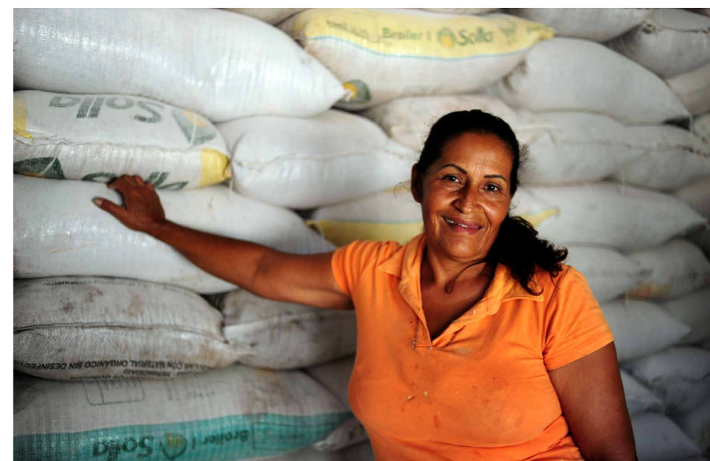
Cassava starch processing in Colombia's southwestern Cauca department