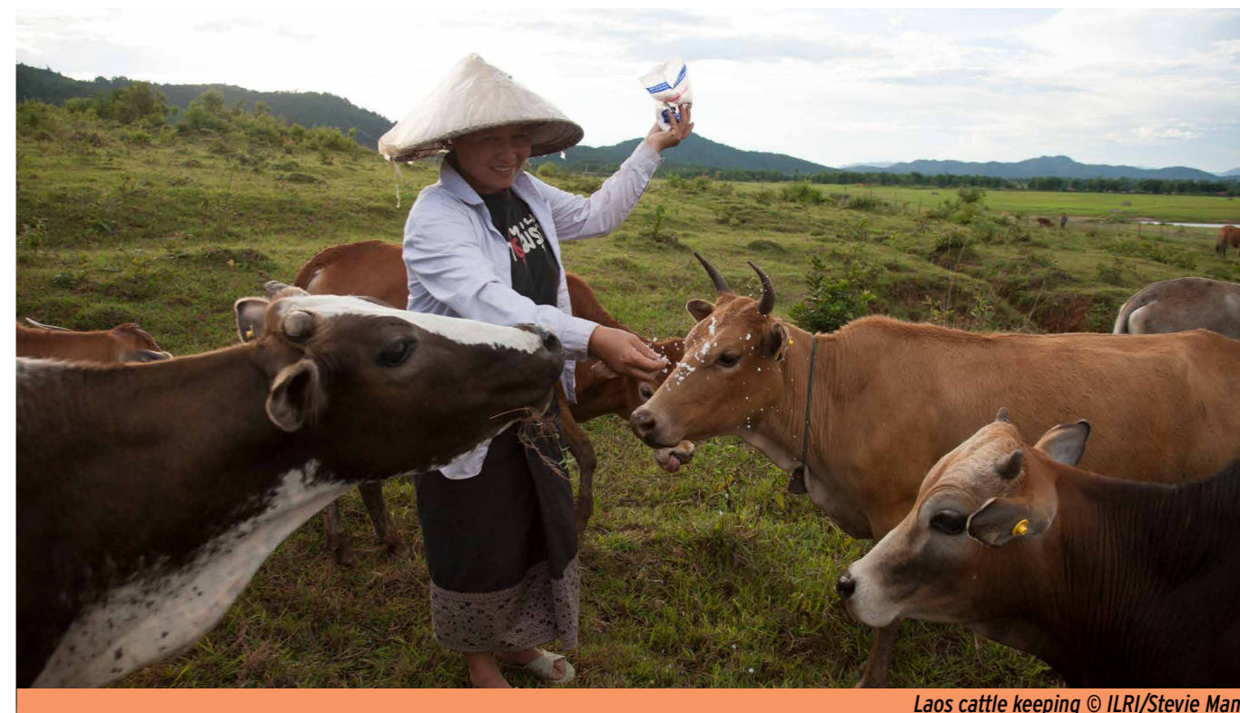
Laos cattle keeping

An actionable pathway towards transformative change requires embedding gender equality and social inclusion into FLW systems science, practice and innovation. In a recent review of more than 100,000 research articles on agriculture, fewer than 5 percent were concerned with problems faced by smallholder farmers (Nature 2020). Tackling this oversight will require organization-wide conversations on institutional cultures by creating opportunities for dialogue across disciplinary, hierarchical, and geographical divides. The CGIAR needs to spell out a powerful shared narrative on why systemic transformation is necessary, and how actions are being taken internally and with partners, to help advance more socially and ecologically resilient FLW systems.