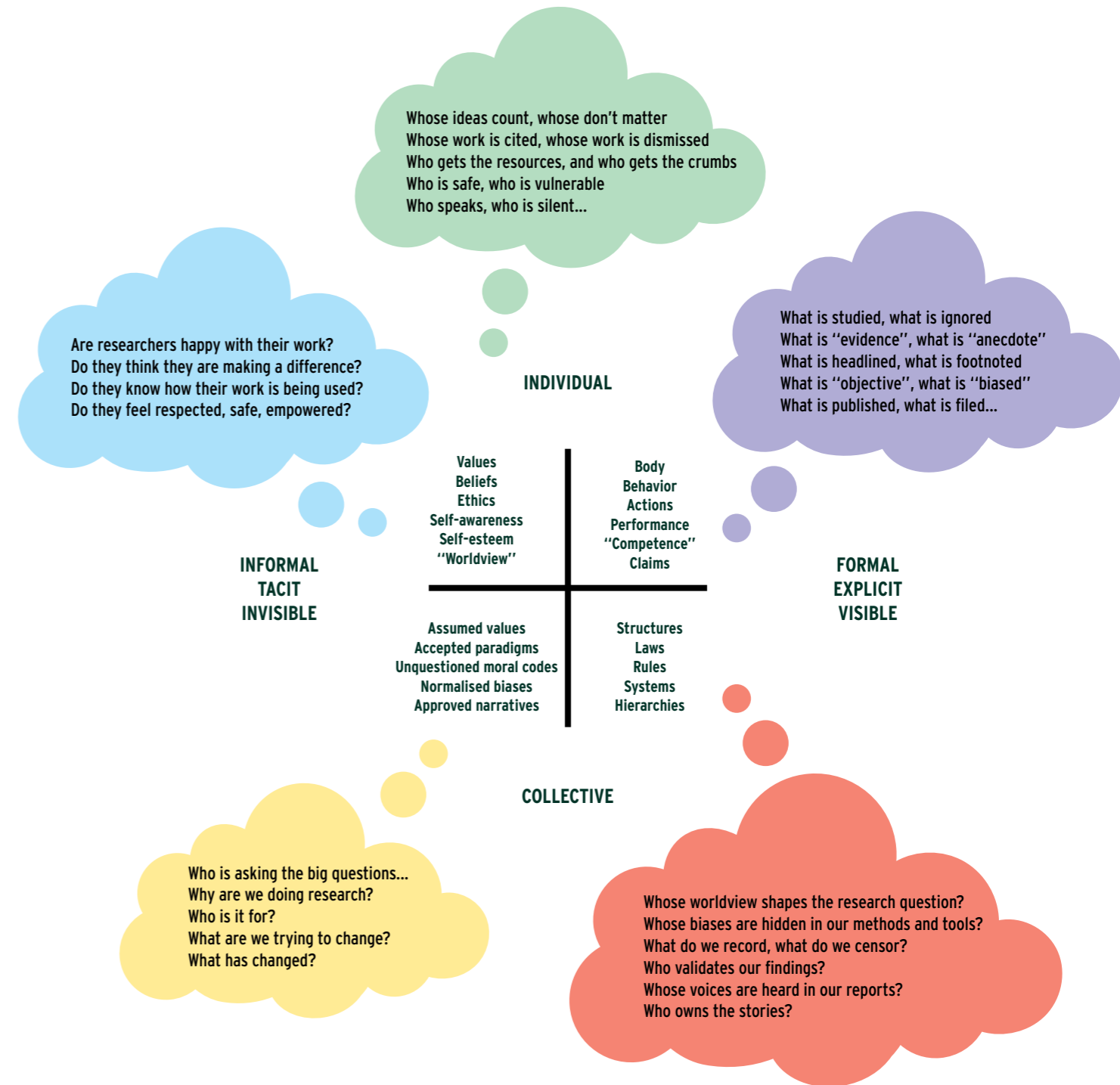
Figure 2: Exercise with CGIAR Climate Science Researchers (2017)

2 outlines an exercise with climate science researchers to assess the "invisible facts and unasked questions" shaping climate science research. The analysis shows how individual biases and values, as well as power and hierarchy shape "coalition of knowledges", and what is prioritized (Leeuwis et al. 2017).